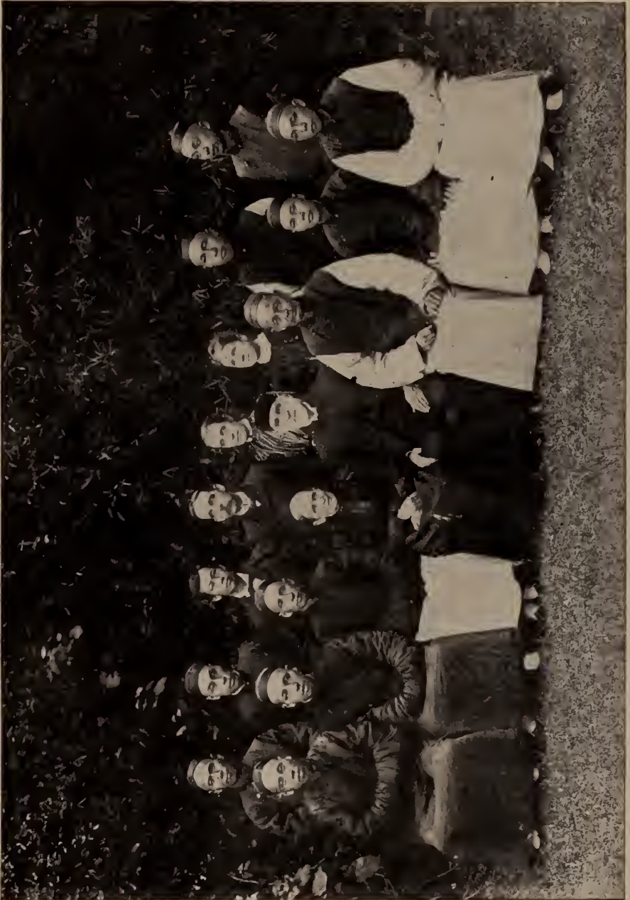
FACULTY OF FOOCHOW COLLEGE.

so much time on his hands, roamed freely about the college buildings into the room of one of the students, and found much to entertain him in the reception